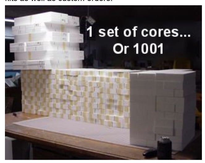
We at Matney Models do create some other cool stuff, please take a look at our website to see some of our carbon fiber and glass fiber capabilities.

Kevin Matney of Matney Models was the first to reach out to us to provide feedback and content. We at Matney models create some very cool stuff, we use a wide variety of materials and building processes, ranging from Complete Kits, to Fiberglass and Carbon fabrication. In addition, we also cut wing cores for both our own models as well as offering a custom cutting services which can offer everything from custom one-offs to multi-thousand unit production runs. I have cut more foam with this program than of all the others together. I use about 40 sheets a month, delivering wing cores for both my own kits as well as custom orders.